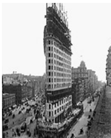
Historical research is directed toward gathering information on a structure's history, original

A preliminary walk through of the building and its site with the owner or site manager, appropriate building staff representatives, and key members of the historic structure report team is important to review the project scope of work. During the walk through, a brief review of existing conditions can be performed to highlight user concerns and gather information about distress and deterioration observed. Building staff may also be able to provide information on recent repairs, current maintenance procedures, and specific areas of active deterioration. A brief review of existing documentation available on site is also useful. Site personnel may be able to recommend additional archival resources.