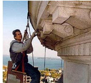
The use of special access methods may be necessary for close-up investigation of building elements. At the Wisconsin State Capitol, project architects and engineers used rappelling techniques.

Depending upon existing conditions and the results of the site inspection, field monitoring may be required. Field monitoring can include humidity and temperature monitoring, documentation of structural movement and vibrations, light level monitoring, and other environmental monitoring.