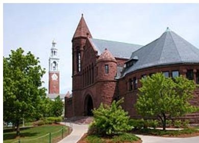
The University of Vermont has more than thirty contributing buildings in four historic districts listed in the National Register of Historic Places. The Campus Master Plan recognizes a commitment to respect and maintain the historic integrity of these facilities. Historic structure reports are available for many of the University's historic structures.

Besides the building itself, a historic structure report may address immediate site or landscape features, as well as items that are attached to the building, such as murals, bas reliefs, decorative metalwork, wood paneling, and attached floor coverings. Non-attached items, including furniture or artwork, may be discussed in the historic structure report, but usually receive in-depth coverage in a separate report or inventory. One significant property may include multiple buildings, for example, a house, barn, and outbuildings; thus, a single historic structure report may be prepared for several related buildings and their site.