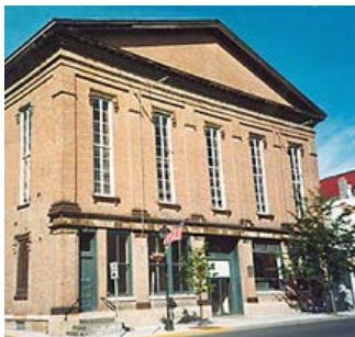
At the Hudson Opera House, a multi-arts center in Hudson, New York, the historic structure report was prepared incrementally. The first phase of the report focused on assessment and recommendations for repair of the roofing, the most critical issue in preservation of the building.

The length of time required to prepare a historic structure report and the budget established for its development will vary, depending on the complexity of the project, the extent and availability of archival documentation, and to what extent work has already been performed on the building. If the scope of a historic structure report for a simple building is limited to a brief overview of historic significance, a walk-through condition assessment, and general treatment, the study and report may be completed within a few months' time by an experienced investigator. On the other hand, a historic structure report for a larger building with numerous past alterations and substantive problems will require extensive research and on-site study by a multidisciplinary team. This type of report can often take up to two years to complete.