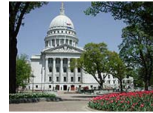
Historic structure reports are prepared for many different types of structures with various intended uses. Examples include courthouses and state capitols still serving their historic function, such as the Wisconsin State Capitol (above); significant properties that are to be rehabilitated and adaptively reused; and properties that are to be preserved or restored as house museums.

In response to the many inquiries received on the subject, this Preservation Brief will explain the purpose of historic structure reports, describe their value to the preservation of significant historic properties, outline how reports are commissioned and prepared, and recommend an organizational format. The National Park Service acknowledges the variations that exist in historic structure reports and in how these reports address the specific needs of the properties for which they have been commissioned. Thus, this Brief is written primarily for owners and administrators of historic properties, as well as architects, architectural historians, and other practitioners in the field, who have limited experience with historic structure reports. It also responds to the requests of practitioners and owners to help define the scope of a historic structure report study.