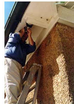
Paint studies may not only help establish the chronology of paints and paint colors used on a building but also may aid in the dating of existing architectural features. Examination of the paint layers on these modillions utilizing a hand-held microscope enabled an investigating team to confirm in the field which modillions were original and which were later replacements.

The process of evaluation occurs throughout the study of the historic structure as information is gathered, compared, and