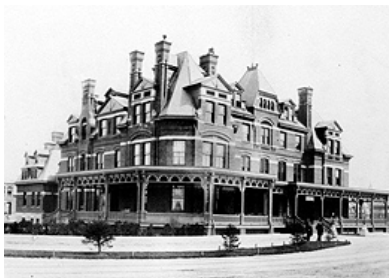
The historic structure report for the Hotel Florence, shown here in 1886, provided a basis for stabilization and repair work which has been completed. Initial phases of work addressed preservation of the building envelope, structural repairs, and limited mechanical and electrical improvements. The report also provided recommendations for future rehabilitation work that will be implemented in phases as funding becomes available.

The work recommendations are a central feature of the report. They are developed only after the research and investigation has been completed and the overall project goal established as to whether a particular building should be preserved, rehabilitated, restored, or reconstructed. The specific work recommendations need to be consistent with the selected treatment. If analysis performed during the study suggests that the approach or use initially proposed would adversely affect the materials, character, and significance of the historic building, then an alternate approach with a different scope of work or different use may need to be developed. The process of developing work recommendations also needs to take into account applicable laws, regulations, codes, and functional requirements with specific attention to life safety, fire protection, energy conservation, abatement of hazardous materials, and accessibility for persons with disabilities.