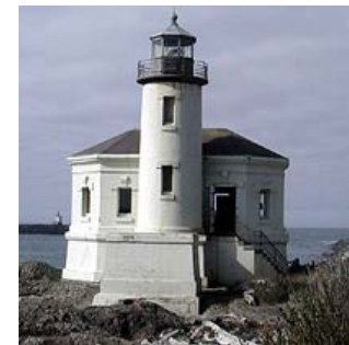
Numerous factors influence the cost of preparing a historic structure report including the level of significance, size, and complexity of the property; required treatment and use; existing condition; and the location and access to the structure. Historic structure reports were prepared for several small lighthouses along the Oregon coast, including the Coquille River Lighthouse, shown here.

7. The type of final report that is required can significantly affect the cost of the project, but is an area where costs can readily be controlled. Historic structure reports do not necessarily need to be professionally bound and printed. In-house desktop publishing has become commonplace, and a formal work product can often be obtained without excessive costs. Overly sophisticated printing and binding efforts represent a misplaced funding allocation for most historic properties. There are distinct advantages to having a report prepared in an appropriate electronic form, thus reducing the number of hard copies and facilitating future updates and additions to the report. For most properties where historic structure reports are prepared, ten or so hard copies should suffice. Providing one copy of the report in a three-ring binder is a helpful and inexpensive way to furnish the owner with a "working" copy of the document.