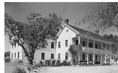
The treatment approach selected for a building usually is determined by the intended use of a property, funding prospects, and the findings of an investigation. The Wolf Creek Inn, operated by the Oregon Parks and Recreation Department, is among the most intact and oldest active traveler's inns in Oregon. The historic structure report outlined a rehabilitation treatment which included such work recommendations as repairs to specific historic fabric, landscape restoration and site improvements, and upgrading of the building's mechanical and electrical systems. Photo: Historic American Building Survey, 1934.

The Standards and their accompanying Guidelines describe four different options for treatment and list recommended