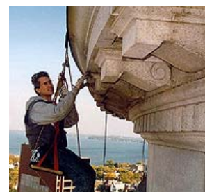
Wisconsin State Capitol.