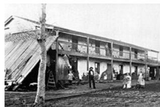
Historical photographs are an invaluable aid and time saver in establishing a building's original construction and evolution; in guiding the replication of missing features; and even in understanding existing material deterioration. The availability of information, such as archival photographs, surviving original architectural drawings, or HABS documentation, has a direct bearing on the cost of preparing a historic structure report. In this circa 1890 photo of the Rancho San Andrés Castro Adobe, the "lumbering up" on the south end is a character-defining feature of adobe construction that is rarely seen today. Photo: Historic Structure Report for Rancho San Andrés Adobe by Edna Kimbro, State Historian, California State Parks, Monterey District

The procedures for preparing a historic structure report and the outline of report content and organization can serve as the basis to develop a scope of work for the study and also to solicit proposals for a report that reflects the requirements of the specific structure, and, of course, the available budget. Although the request for proposals should always establish such a scope of work, firms may be invited to suggest adjustments to the scope of work based on their past experience. The request for proposals should include a qualifications submittal from each proposer. This submittal should include resumes for the principal investigators and a description of experience in preparing historic structure reports or similar studies, as well as experience with buildings of similar type, age, and construction to the subject of the study. References and sample of work may be requested from the proposer as part of this submittal. An interview with one or more candidates is highly recommended, both so that the proposers can present their project approach and qualifications, and so that the client can ask questions in response to the submitted proposal.