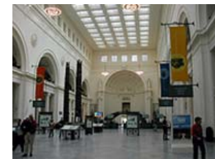
The scope of such studies includes the interior as well as exterior of the historic structure. This is the interior of the Stanley Field Hall, Field Museum, Chicago.

building code consultants, photographers, and other specialists.