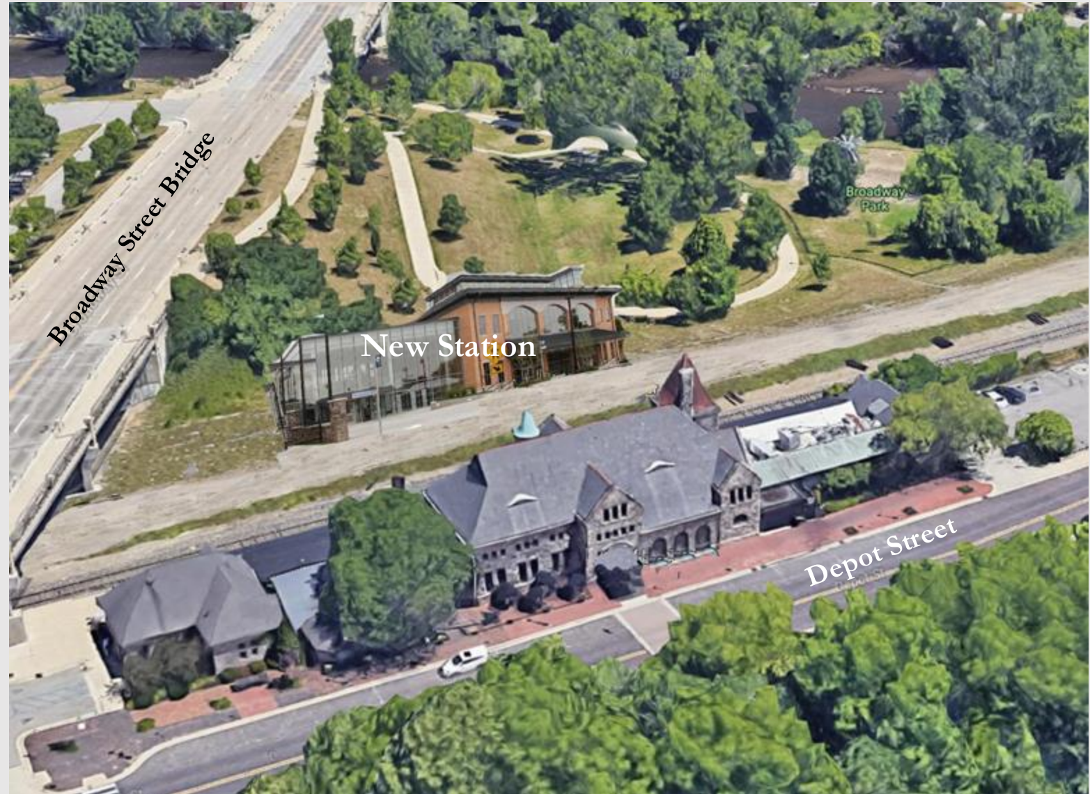
Gandy Dancer restaurant and riverfront parks

Could a new station work on the other side of tracks?