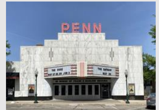
Penn historic theater