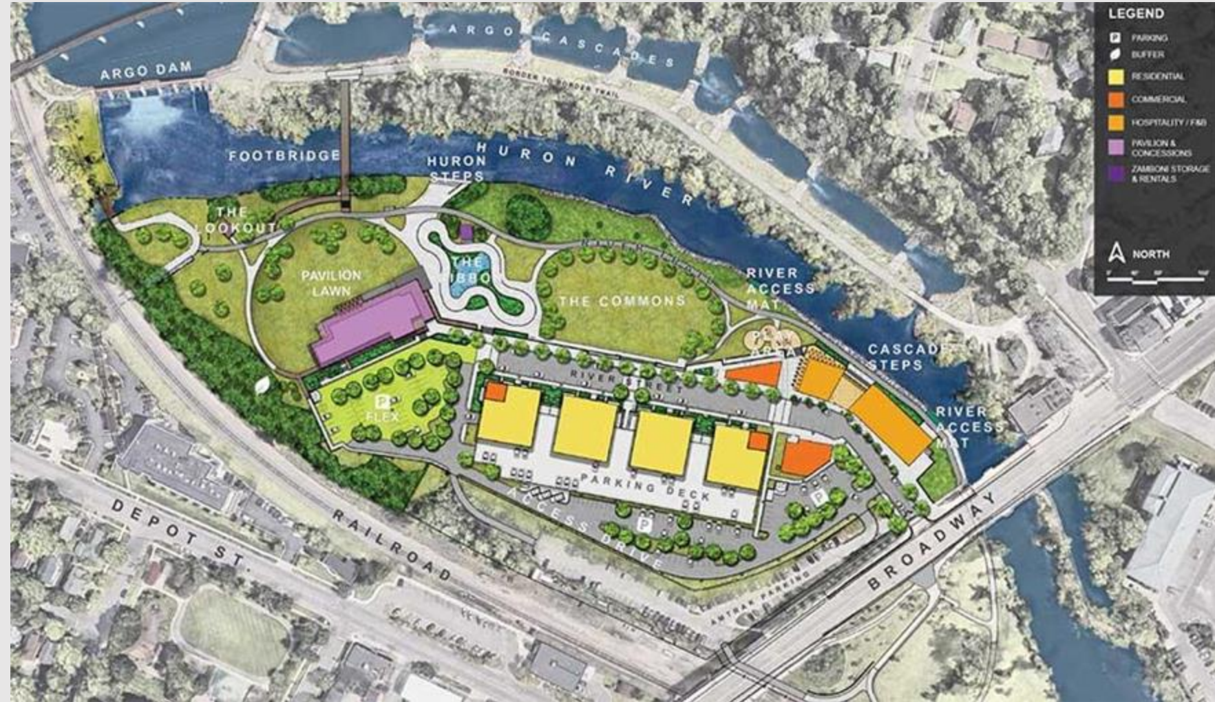
Broadway Park West

Ambitious plans for riverfront redevelopment with Broadway Park West will provide amenities for both public and private users.