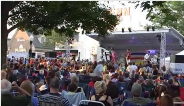
Outdoor concerts, farmers market, ice festival, art fair, car show