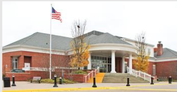
New community library