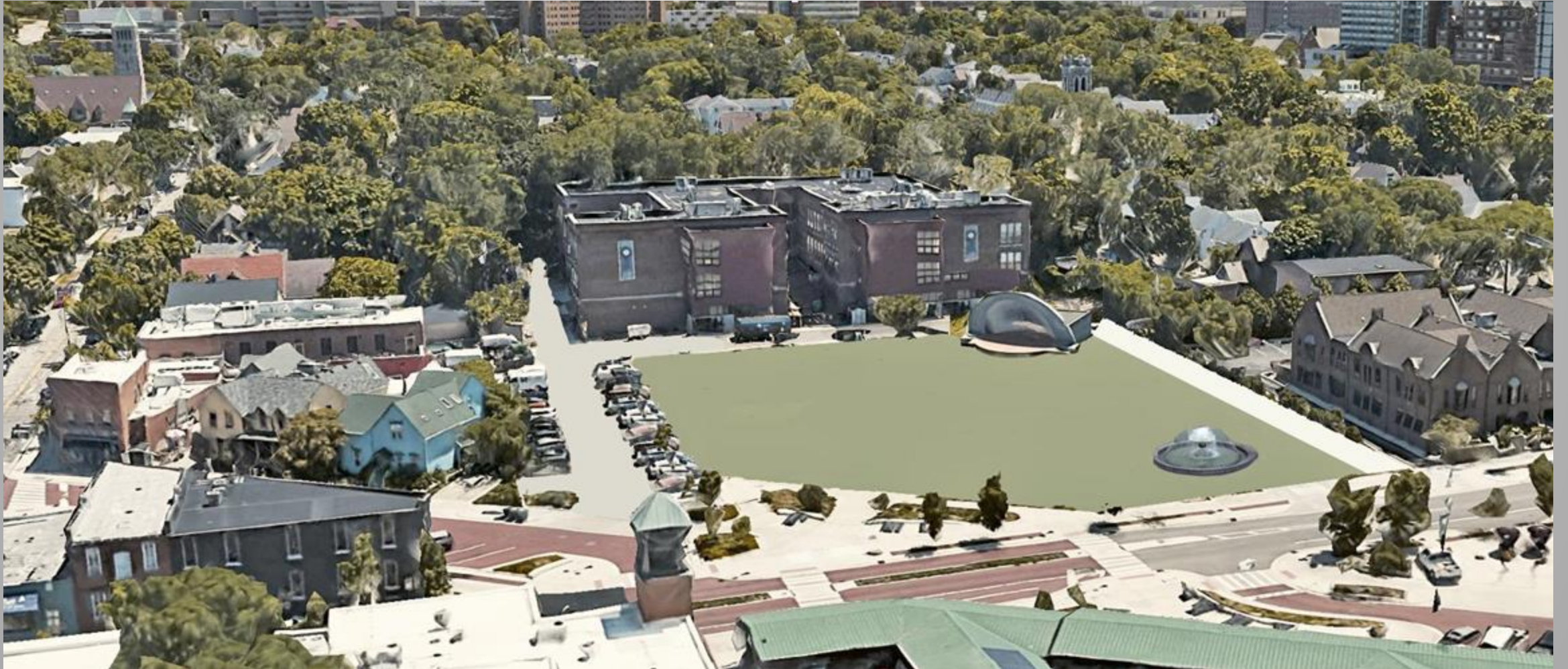
Concept for “Carpenter Culture Park”

“Encourage the preservation and improvement of the Community High open space area on Fifth.”