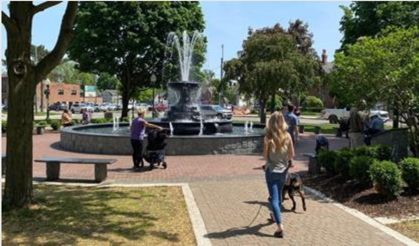
Kellogg Park fountain

Plymouth, Michigan, has an active and vital Town Square.